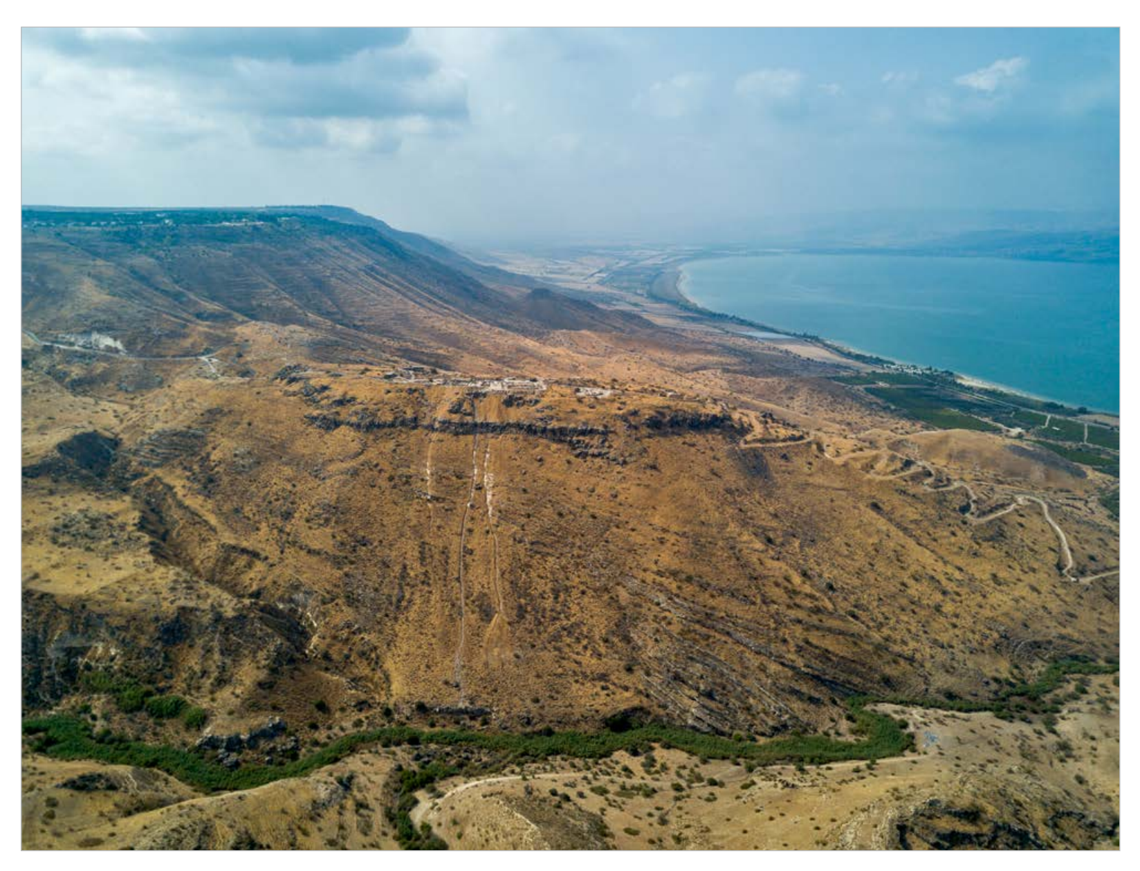
Fig. 1.2 Mount Sussita, with the Ein-Gev stream flowing below it and the Sea of Galilee to its west.

This second, and last, volume to summarize the first twelve years (2000–2011) of research at Hippos (Sussita) of the Decapolis is published four years after the publication of the first volume in early 2014 (Fig. 1.1).<sup>1</sup>