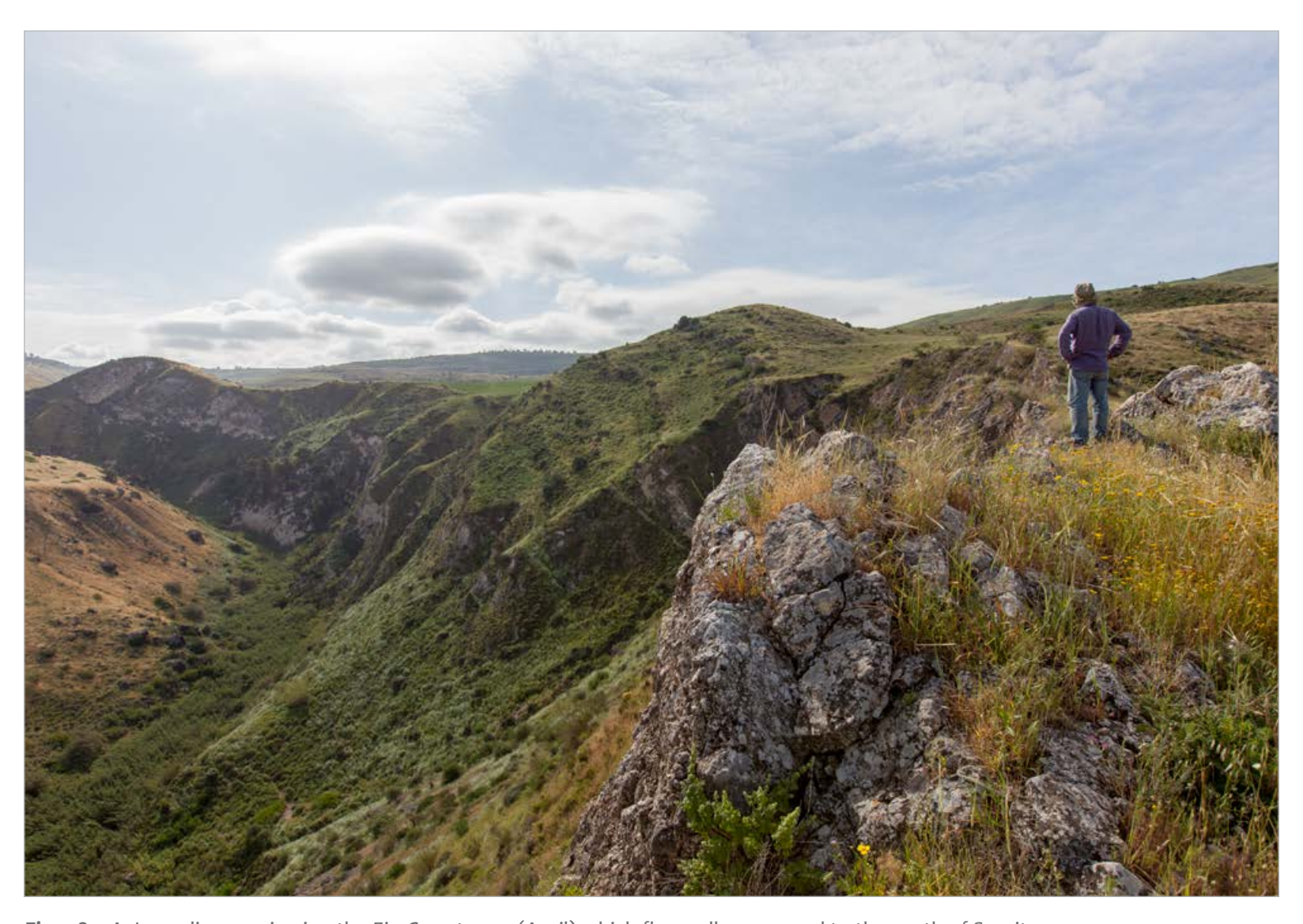
Fig. 1.8 A. Iermolin overviewing the Ein-Gev stream (April) which flows all year round to the north of Sussita.