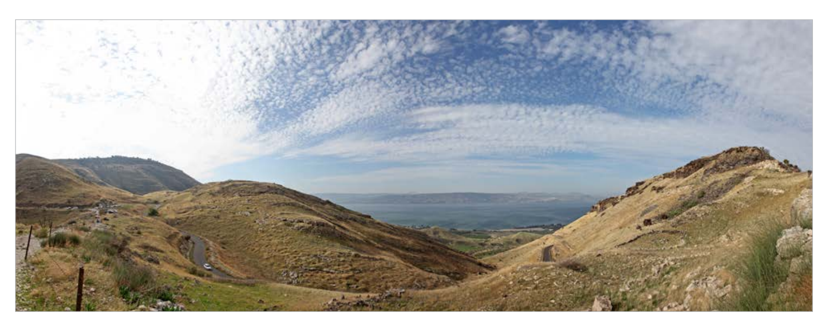
Fig. 1.4 A panorama view from Sussita saddle-ridge towards the Sea of Galilee.